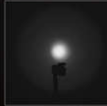
9 Lumens (71hrs)

★ High efficient reflector, perfect combination of focus beam and flood beam