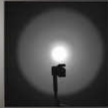
47 Lumens (13hrs)