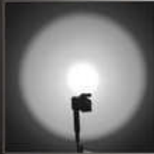
180 Lumens (2 hrs)