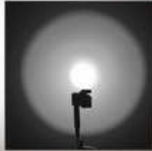
100 Lumens (5hrs)