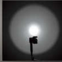
70 lumens (9hrs)