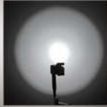
125 lumens (4hrs)