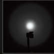
10 lumens (65hrs)

Perfect combination of flood beam and focused beam with highly efficient reflector