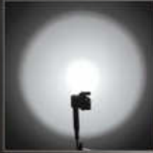
235 lumens (1.5hrs)